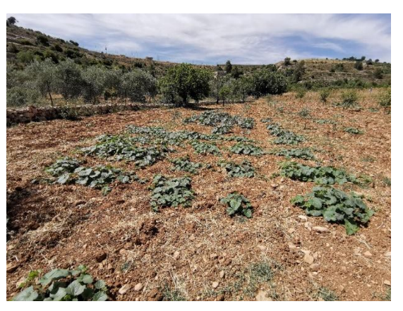
Birds Problem (eating the sowed seeds).