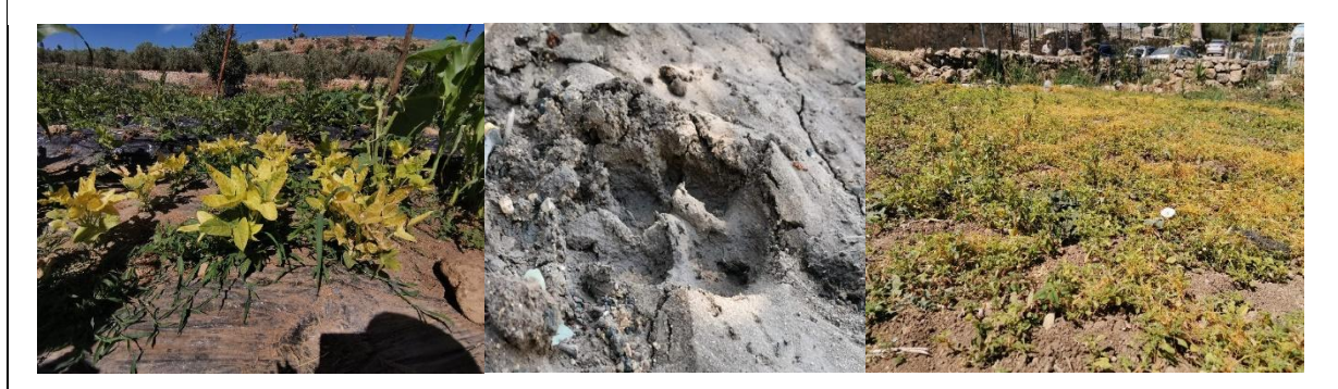
Severe nutrient deficiency