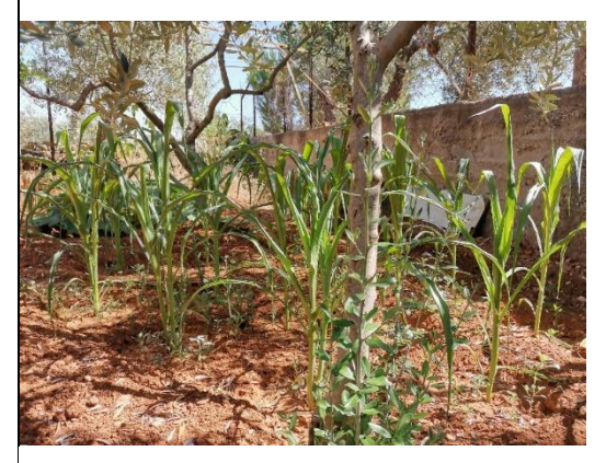
A critical stage of wilting, that can lead to permanent wilting point phenomenon.

At least 81 field visits were implemented, to follow up the land agricultural status and the farmers guidance during the visit represents of: pest control, record crops production (distributed production sheet), and cover the soil either with sheet mulching or straw. The visits also aimed at observing problems that mostly farmers face and suggest solutions that are consistent with traditional farming and Eco farming practices.